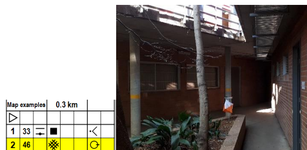
Figure 3 Thicket east end