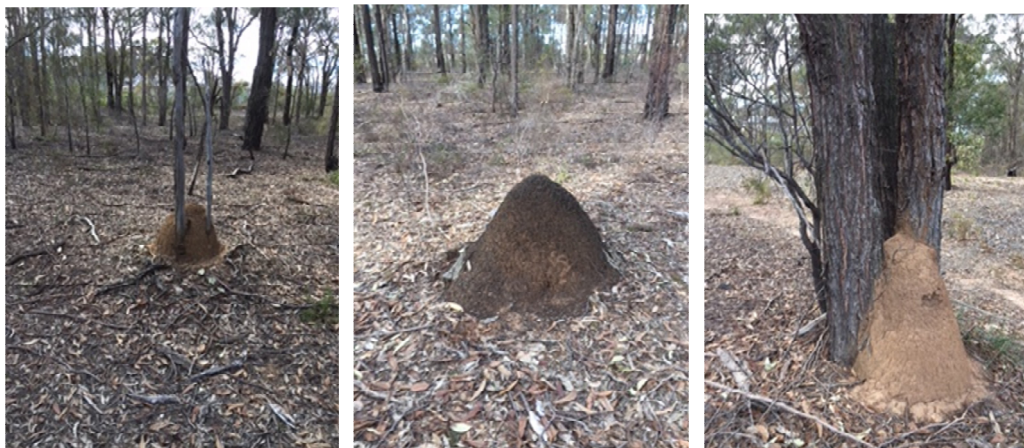
Typical termite mounds

The hard courses contain at least one pivot control. A pivot control is one that is visited more than once. In the attached example the same control is used as control 1 and 6. You must punch the SI Unit both times you visit the control. When leaving a pivot control take care to go to the correct next control. In the example after visiting control 1 your next control is 2. After visiting the second time as control 6 your next control is 7.