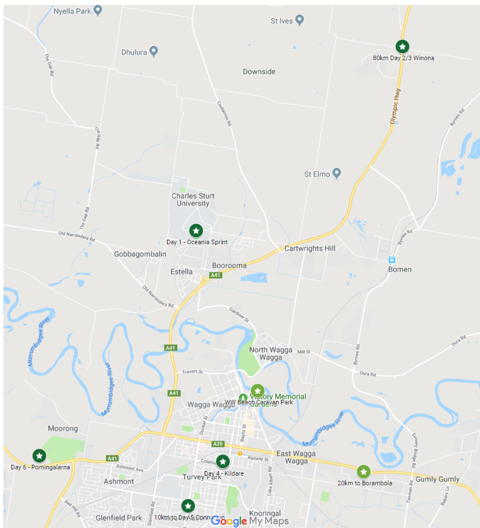
Oceania 2019 venues in and around Wagga Wagga