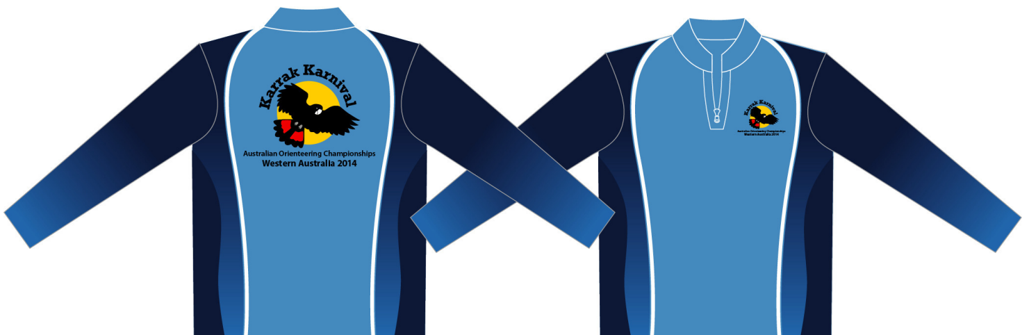
Long sleeved version $52.00

Orders for shirts can only be made under “ services ” in the Australian Long Distance entry listing in Eventor