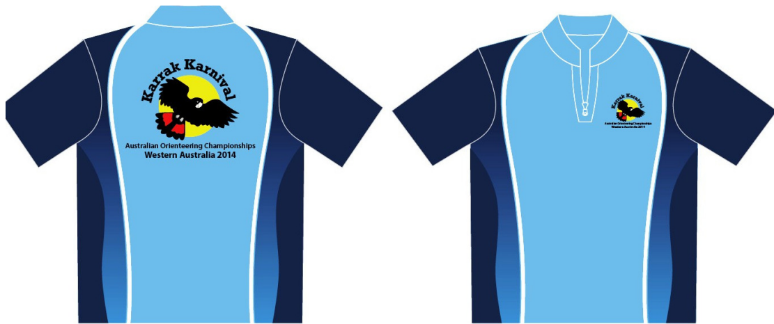
Short sleeved version $46.00