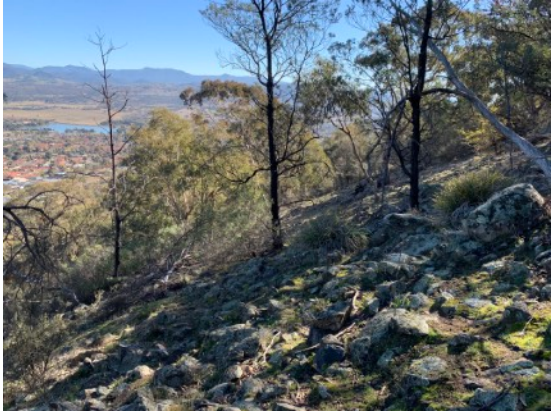
A rocky slope overlooking lake Tuggeranong