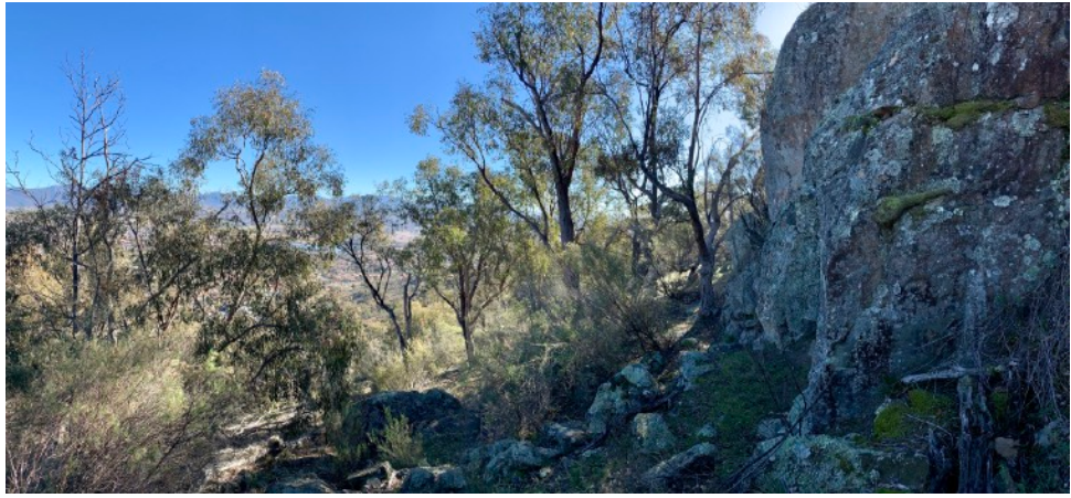
There are some sizeable rock features