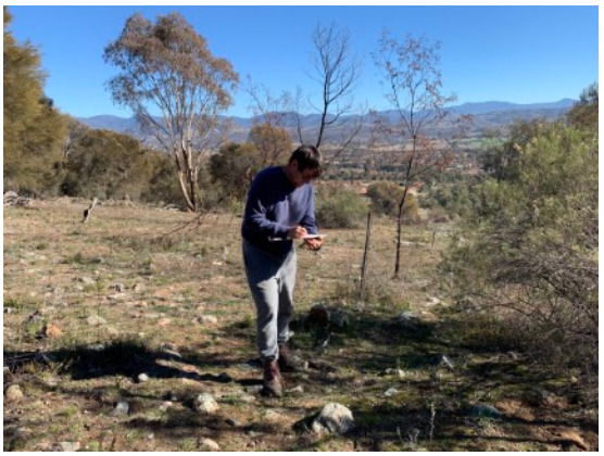
Marian in action - one of the fast areas

Be warned that the course lengths are shorter to account for the challenging terrain. We advise that you choose the course that you would normally do, rather than running up a course based on the length alone.